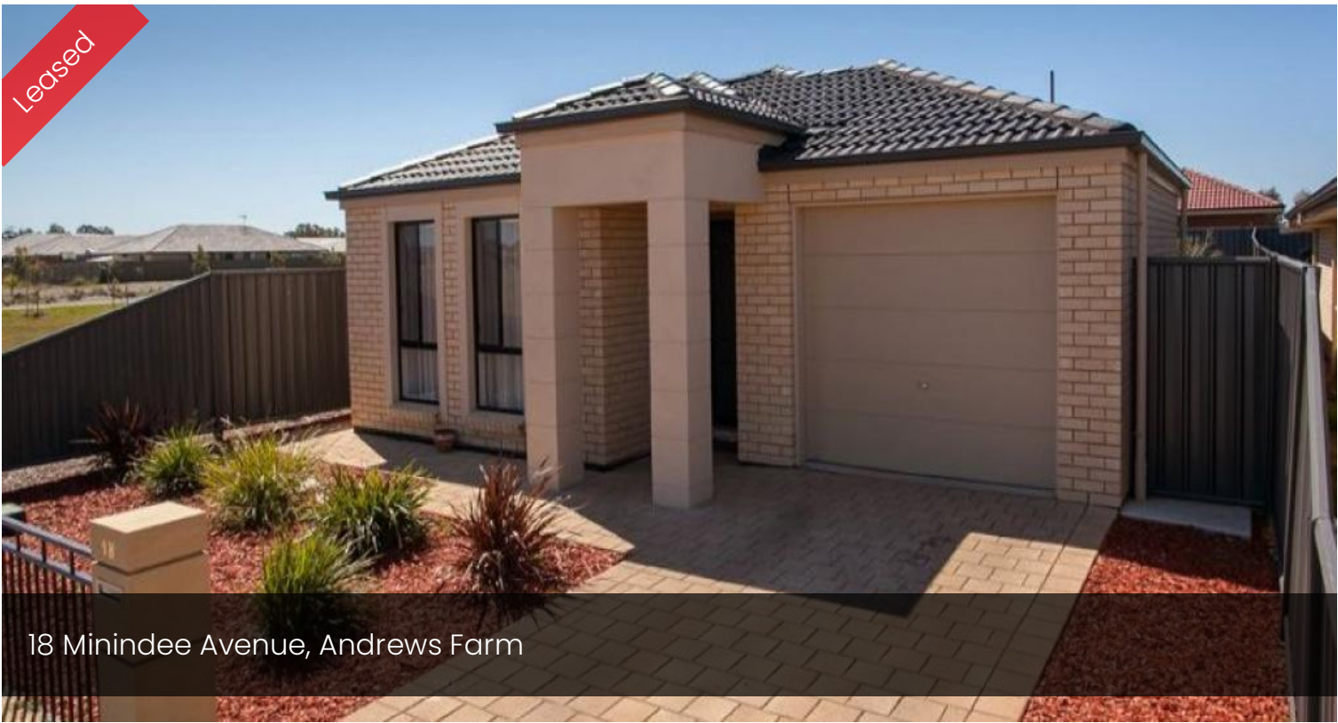
18 Minindee Avenue, Andrews Farm