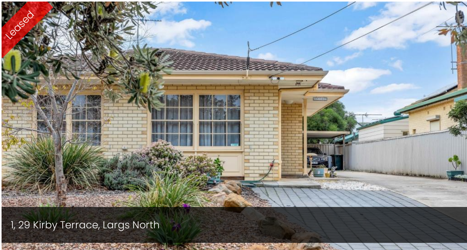
1, 29 Kirby Terrace, Largs North