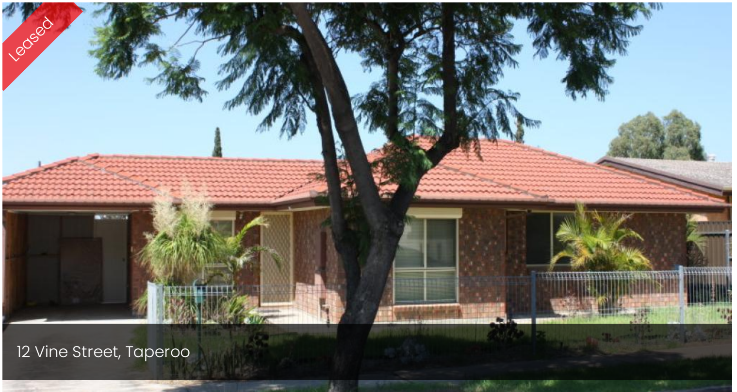
12 Vine Street, Taperoo