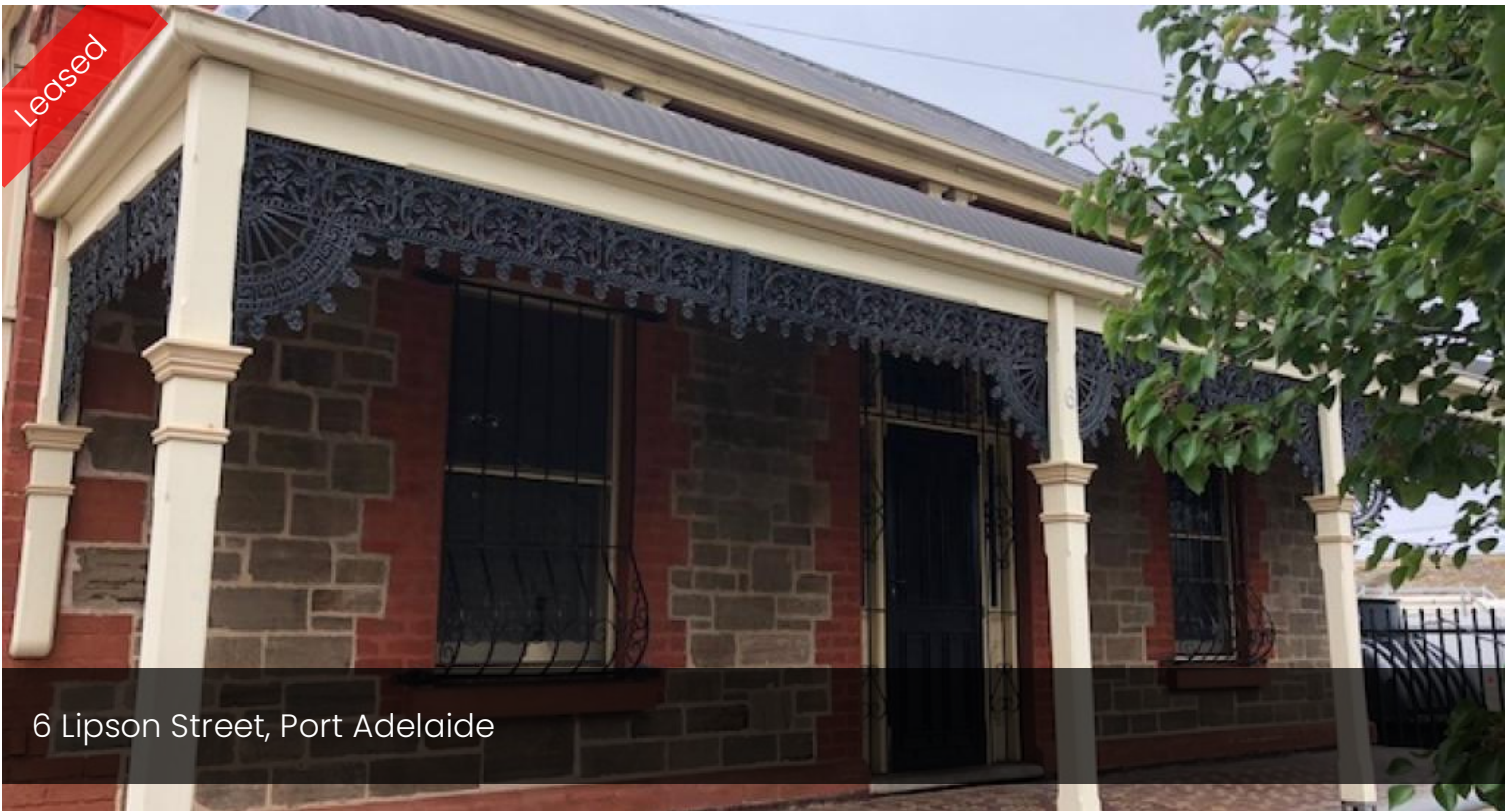
6 Lipson Street, Port Adelaide