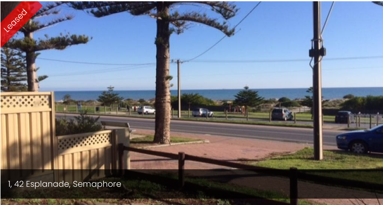
1, 42 Esplanade, Semaphore