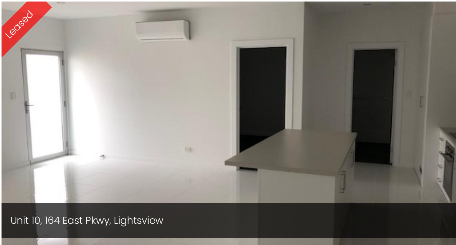
Unit 10, 164 East Pkwy, Lightview