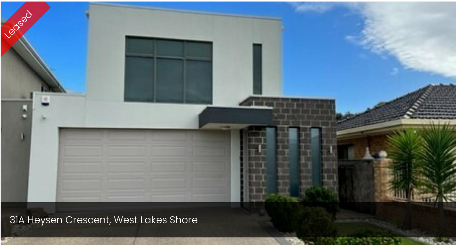
31A Heysen Crescent, West Lakes Shore