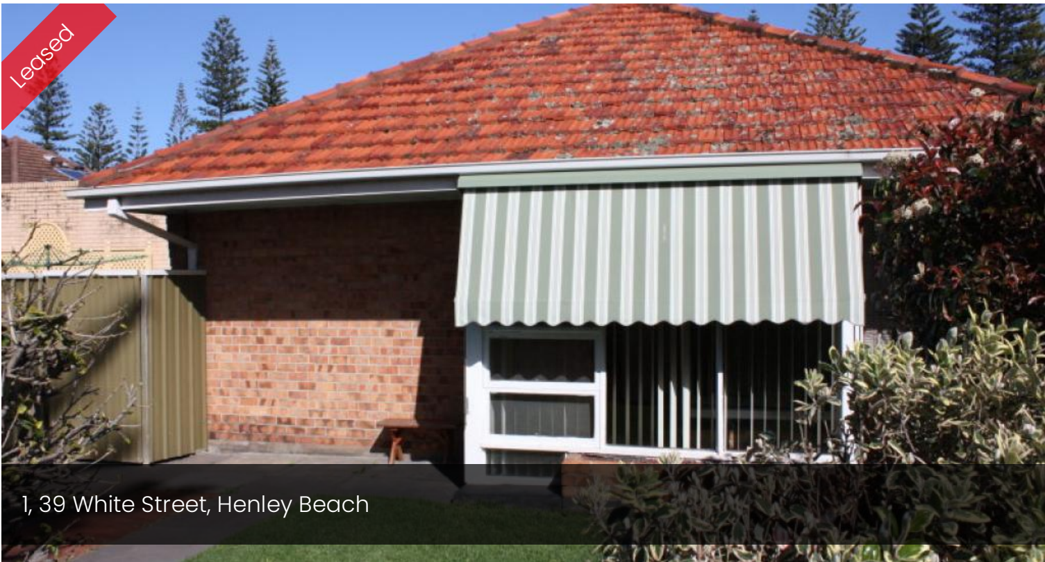
1, 39 White Street, Henley Beach