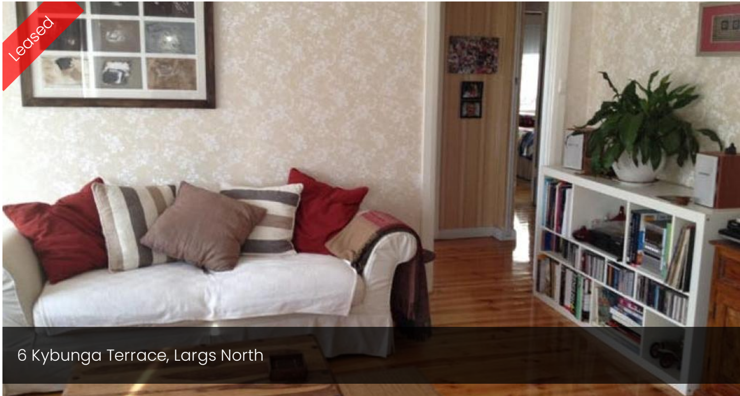
6 Kybunga Terrace, Largs North