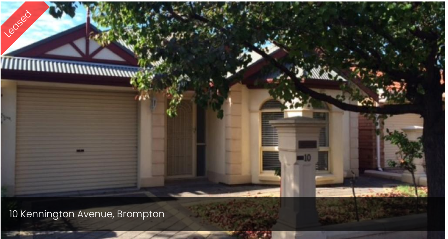
10 Kennington Avenue, Brompton